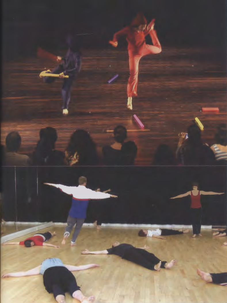
▲ The Dalcroze method can involve movement, aural training and improvisation at the same time

As bipeds, we find playing in two and four time natural. Playing music with three counts, or in compound time, means that the emphasis alternates from side to side. For string players this transfers directly to the often problematic bowing pattern of DOWN-up-down UP-down-up. Experiencing this pattern by stepping in time to music in the relevant metre, showing the strong beats by clapping, means that the student will understand it physically before transferring it to the instrument.